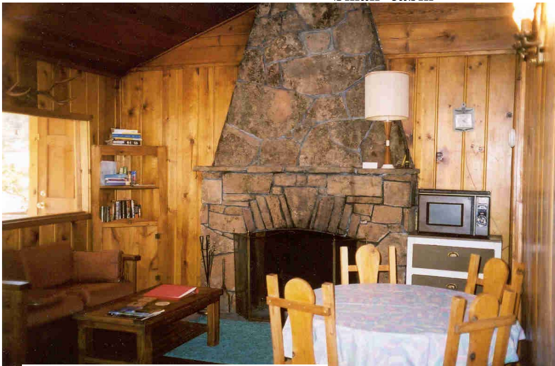
View of one side of the living room.