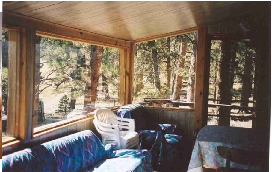
One view of the den, which also has a sofa bed