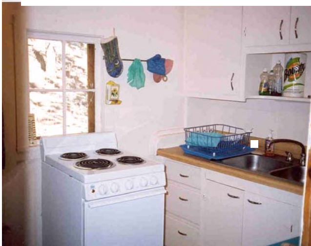
This cabin is all electric and has a microwave, refrigerator and new stove.