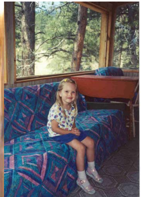
Relaxing in the den.