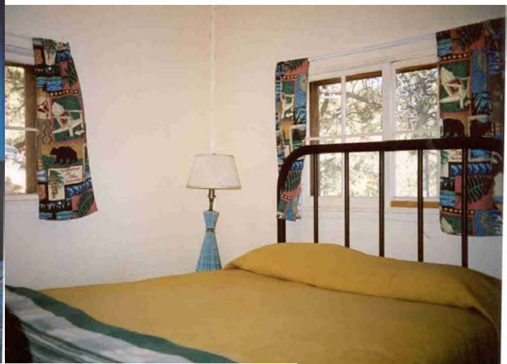
Two bedrooms with double beds and chests of drawers .