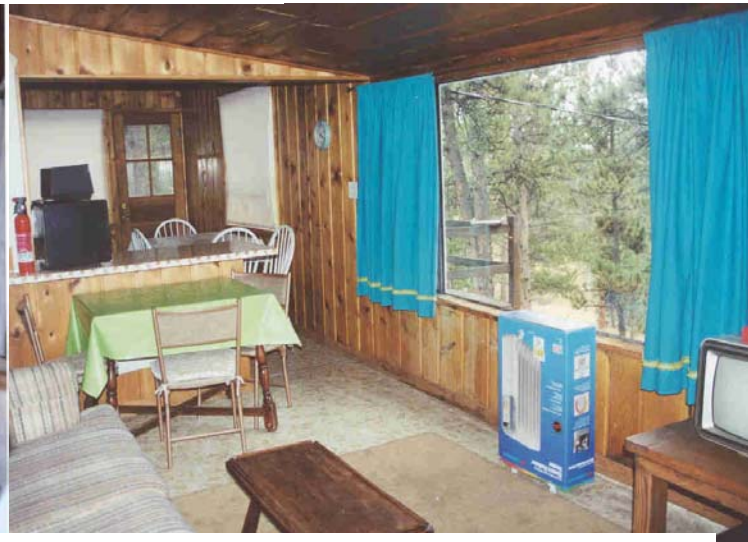
Living room also has a twin bed and piano (not shown.) Den also has a sofa bed and futon (not shown.)

Master bedroom, has queen bed. (2nd bedroom is showing through open door.)